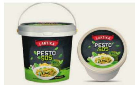
Laktika Pesto Sauce (Pesto Sauce for Horeca)

Thick desserts with different flavors: vanilla, pineapple, peach, blueberry, cherry, strawberry.