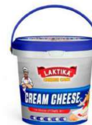
Laktika Cheese Cake Cream Cheese