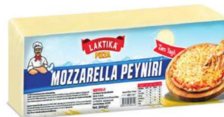
Laktika Block Mozzarella (Mozzarella for Pizza Natural)