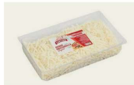
Laktika Shredded Mozzarella (Cubes Mozzarella for Pizza)