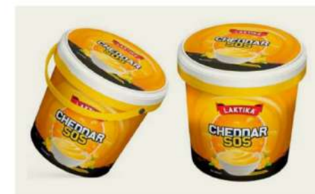
Laktika Cheddar Sauce (Cheddar Sauce for Horeca)